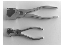
Tube cutting tool