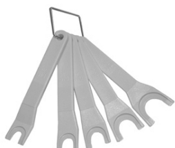
Tool to push the fitting protection

To disconnect the tube it is necessary to push the fitting protection cap with the use of a special tool (see below). First make sure no air is present inside, then press the protection cap in towards the fitting body, remove the tube from the fitting.